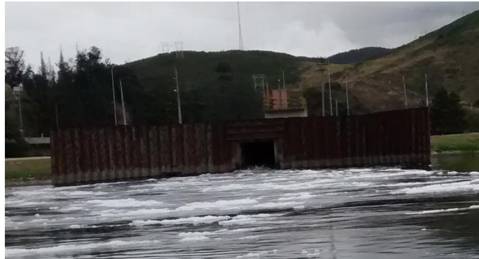
Image 4. Reservoir discharge