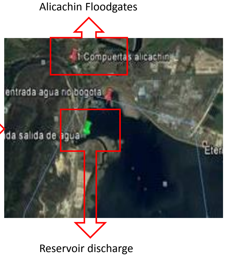
Image 2. Reservoir ubication and detail of floodgates and discharge