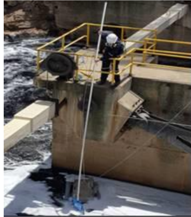
Image 3. Alicachín floodgate and Measurement Process.